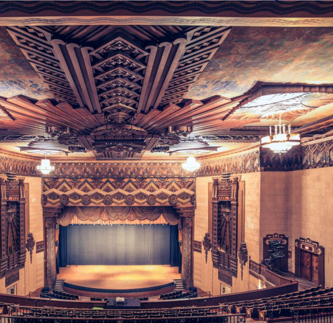
Interior of the magnificent Warner Grand Theatre opened in 1931