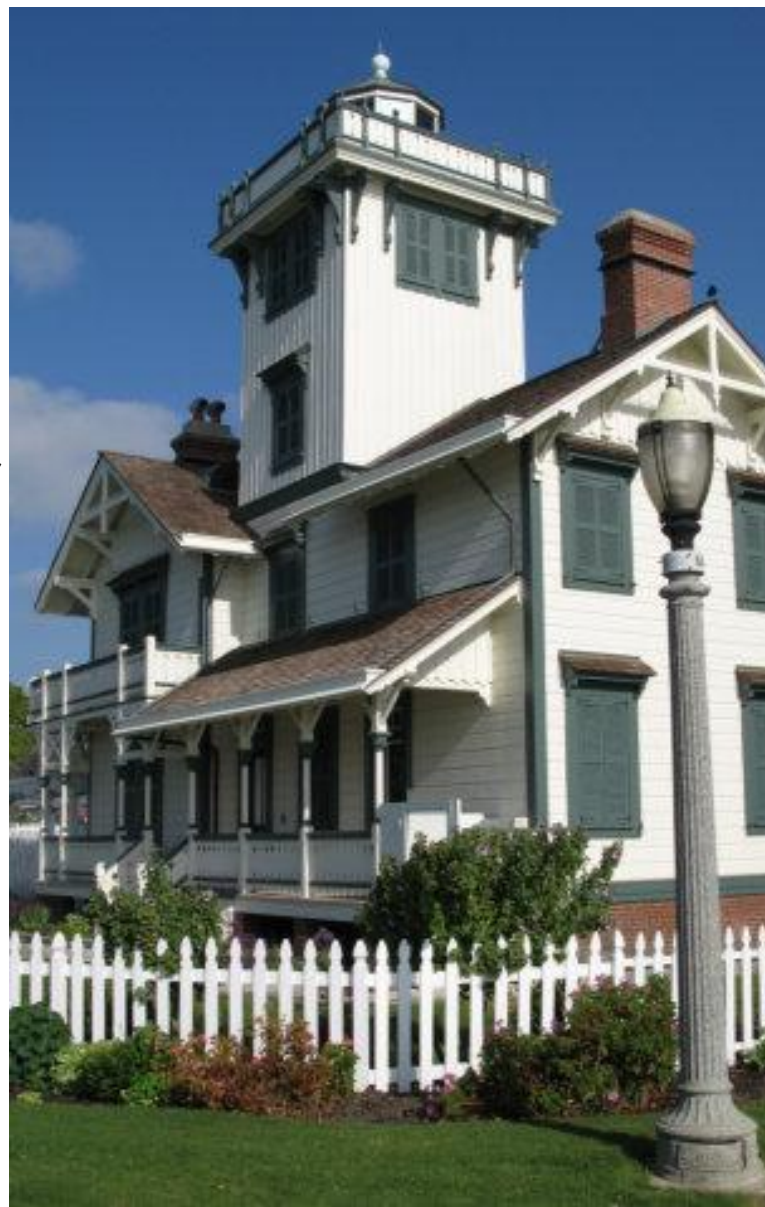
Pt. Fermin Lighthouse.

The ferry terminal was built in 1941 as a federal public works project. It is Streamline Moderne architecture. The ferry served the many Naval personnel, cannery workers, fishermen, and others who wanted the quickest way across the channel. The alternative, since the Vincent Thomas Bridge had not yet been built, was a